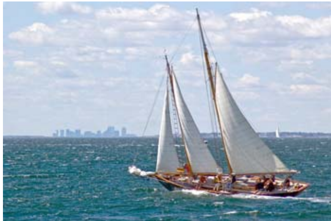
Bound for Boston