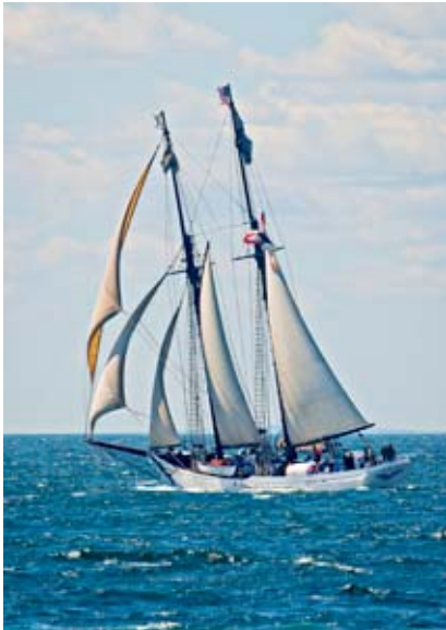
Schooner Alabama

400mm lens and my D70 with a 70 – 300 mm zoom. The 400mm was a little too much lens when the boats were close, but was great as they sailed away from the breakwater. By noontime the boats were all out and too far away for more photo work. We had a great time and got some good images. We learned enough about the event and the photo taking problems to put together a field trip for next year for those who may be interested