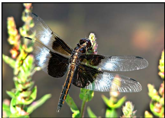
Widow at Delaney WMA