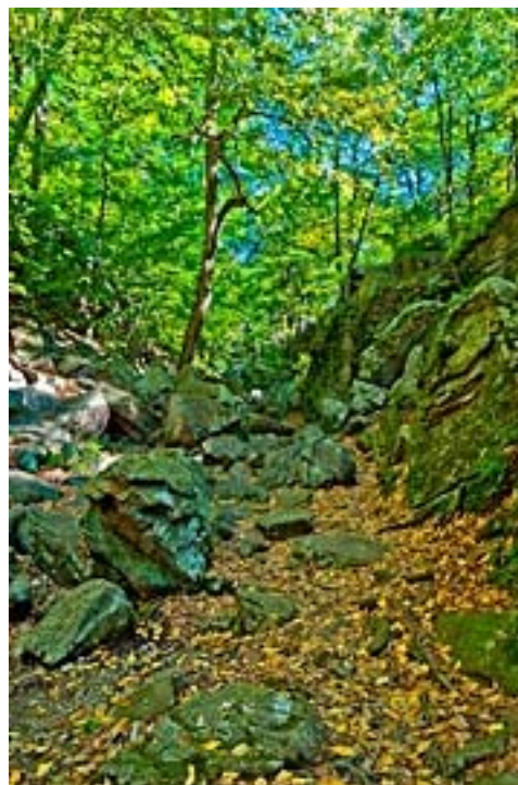
Shot at Purgatory Chasm

http://www.trinitysoftwaredistribution.com/photoshopelements.aspx .