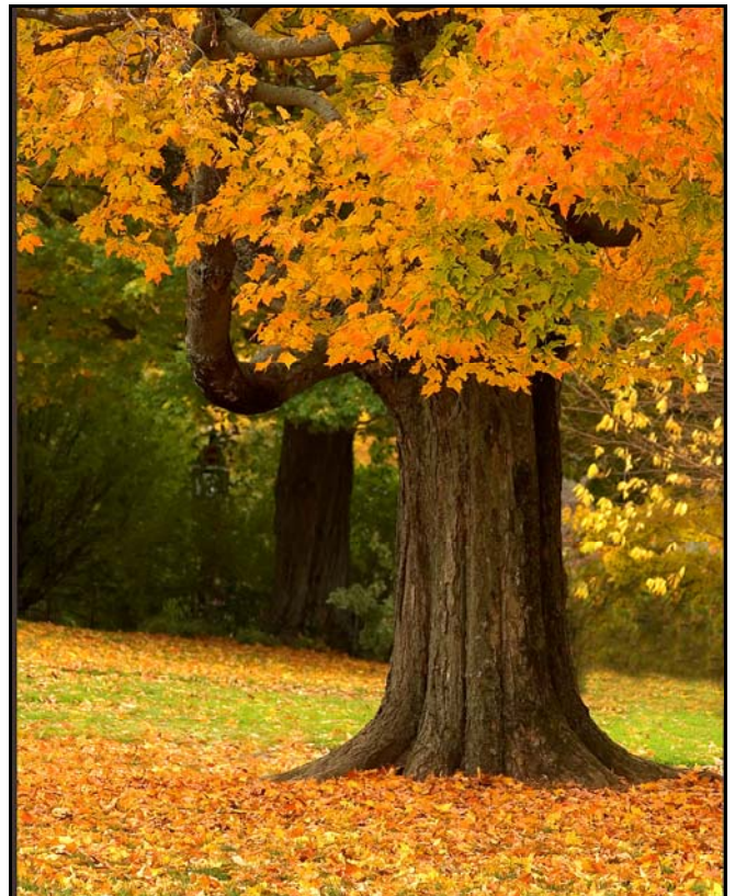
Maple at Tower Hill