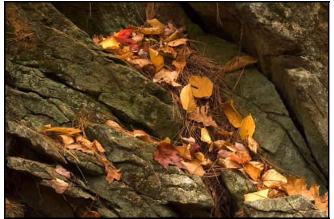
Leaves on Rock

For more distant venues consider the mid-state and upstate areas of New Hampshire, Vermont and Maine.