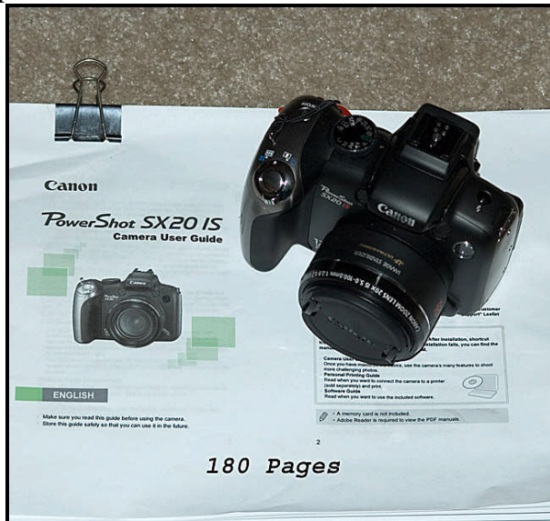
State-of-the Art Point & Shoot