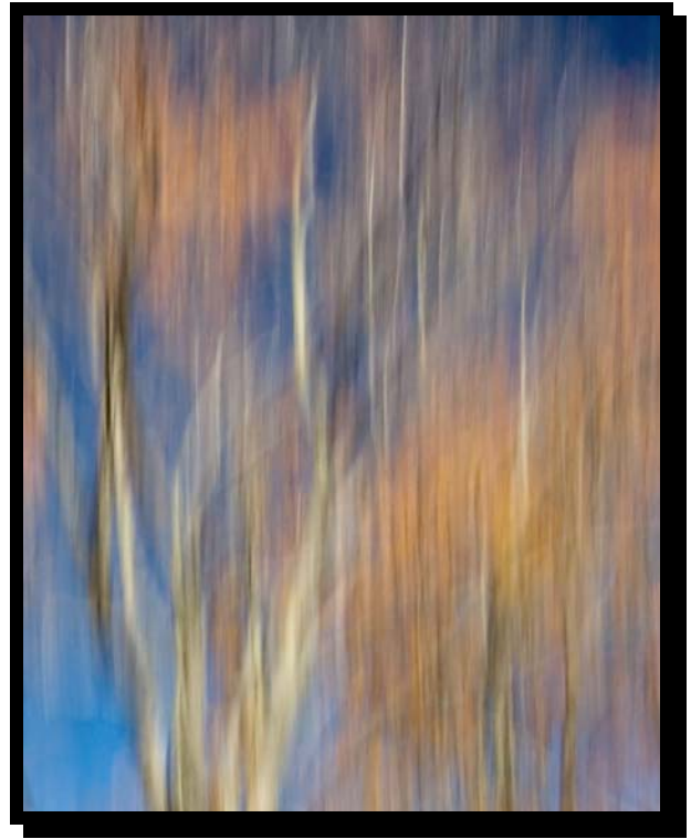
Blurred Fall Scene #1

Depending on your artistic sense you may like some of the images and not others. In any event this technique offers a diversion from the usual fall scenic or leaf images. Arthur Morris and Denise Ippolito have authored a PDF book on the subject of creating blurred images. A Guide to Pleasing Blurs is a 20, 585 word, 271 page PDF illustrated with 144 different image examples. The guide covers the basics of creating pleasingly blurred images, the factors that influence the degree of blurring, the use of filters in creating blurs and a variety of applicable Photoshop techniques. You can order the book for $33 by PayPal via birdsasart@verizon.net .