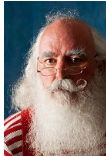
Santa