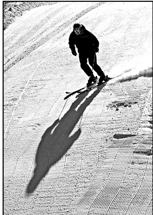
Skier and Shadow