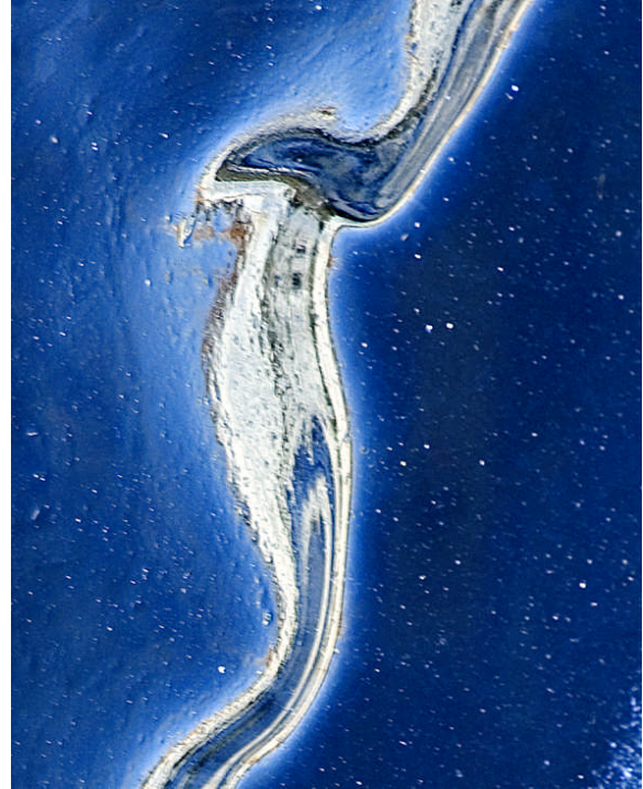
Ice Abstract #3

Later, on a beautiful sunny and temperate day at Sunapee Mountain in New Hampshire, I shot a backlit skier and his shadow. I decided this image would be a good one for presentation in black and white.