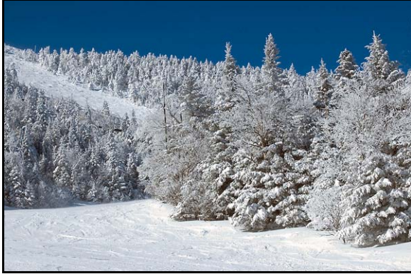
Sugarbush North