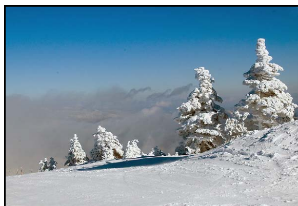
Vermont Winter Scene