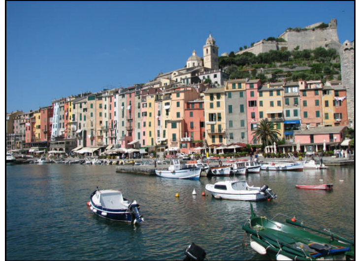
Porto Venere, Italy

most of the biking routes we rode on back roads and bike paths through farm country that was perfectly flat and not photogenic. The towns provided better photo opportunities.