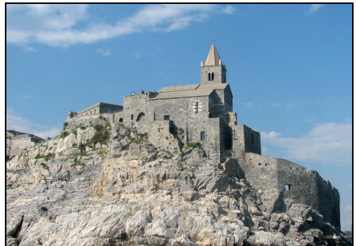
Medieval Church, Italy

We biked six days and covered about 115 miles. We rode a different route each day and stayed in three different hotels, moving every two days. We enjoyed a three day trip preceding the bike tour, staying in Porto Venere and visiting the Cinque Terre region.