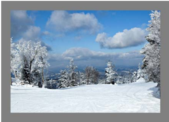
View from Mount Sunapee, NH

Winter is here! The landscape is covered with snow. Now we can pursue winter sports and our photographic passion. It's time to get outside and make some snow and ice shots. Remember the Multi-screen assignment: Frozen