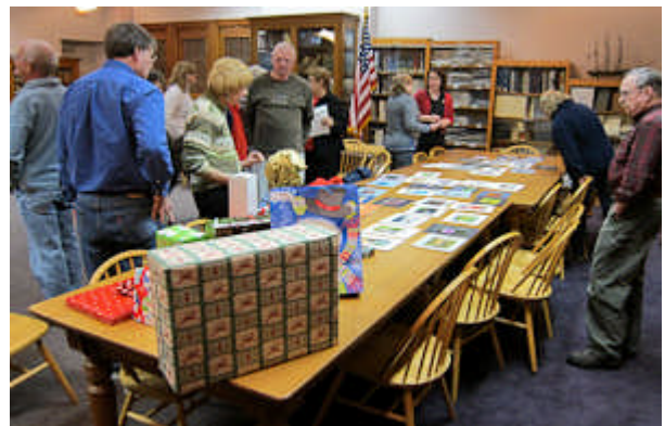
Yankee Gift Swap and Mini Print Salon