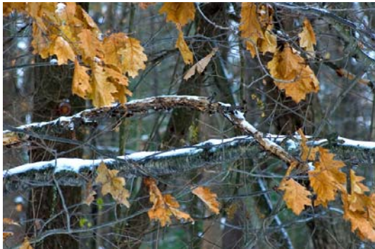
Winter Woods

Winter arrived with a blast this month. Plenty of snow ice and freezing rain which made skiers like me happy on the one hand and on the other caused problems with ice dams and overloaded roofs. Add preparations for the holidays, and there wasn't much time for photography. However, one morning after a light snowfall, I took the photograph below from a back window in our house. Once again, I advise you to take a close look around the area where you live to see if there might be a few subjects worth photographing.