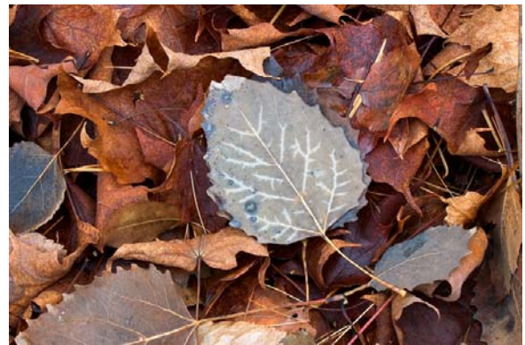
Snake Brook Meadow Leaf

For new members who wish to enter, this salon is an international competition usually garnering approximately 3000 images of which about 1000 are accepted. A catalog is published after the salon containing color reproductions of the medal winners and a listing of all acceptances including image titles and maker's names.