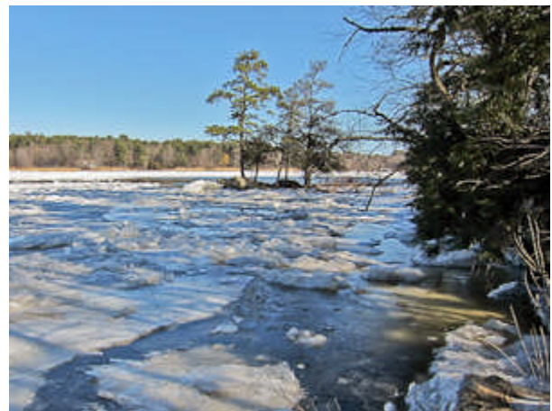
Looking for eagles along the Merrimack

Think spring. Think warm. Think about the pastel greens, pinks and yellows to come.