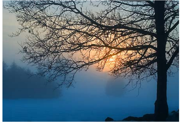
Winter Sunset