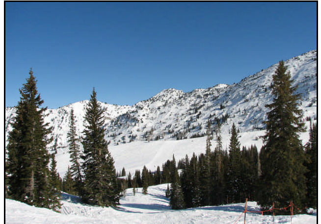
Wasatch Mountains, Utah

With the recent heavy downpours of rain the snow has all but disappeared except in the higher mountain areas. The unusually warm week in the middle of March helped. Even with the colder weather at the end of March, winter has been here and gone. As a last tribute to the season this month's images are from two disparate places. One is from the Wasatch Mountains in Utah where there was snow aplenty the first week in March including a two foot deposit while we were there skiing. The second image is another ice abstract taken locally at the Carlisle cranberry bog.