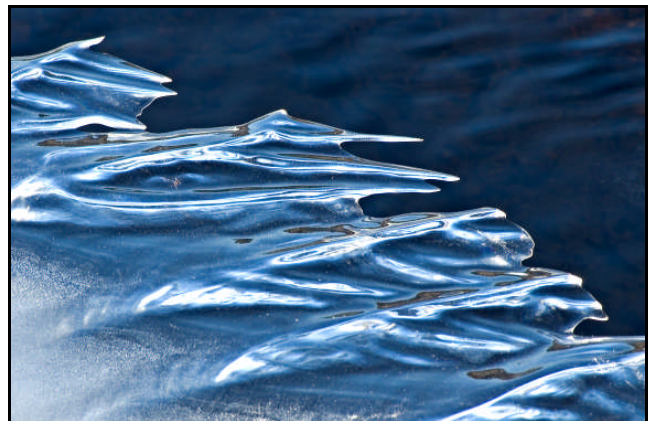
Ice Abstract #3