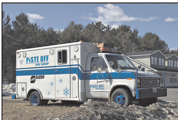
A Novel Sign in Maine

What's your purpose in taking photographs? Is it documentation of your travels to preserve memories; seeking out scenic landscapes or seascapes suitable for exhibition or competition; recording family activities; capturing moments in nature; searching for subjects that meet assigned topics; or any of many other reasons? Stop for a moment and ask yourself if you've ever set out to make a photograph simply for the fun of it. I know you may enjoy photographing for one or more of the above purposes, but what I'm driving at is going out with or without a plan to make a photograph which can be thought by the viewer as funny, such as the illustration of a joke or the capture of a candid situation that would bring a laugh to the viewer of your photo. Some times I think we take ourselves too seriously and get wrapped around the axle of competition.