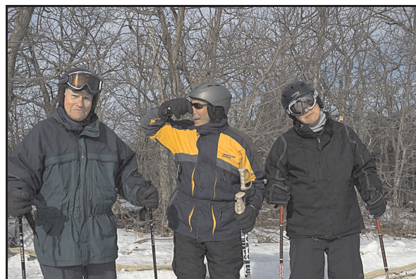
(Guess what happened.) © Dick Kenyon