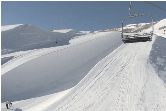
Park City Super Pipe

Temperatures are climbing, the first day of spring has come and gone, and the snow has mostly disappeared in the backyard. Soon the bulbs will poke their heads out, the grass will get green, and the trees will bud. It’s time to gear up for some springtime photography! As a final tribute to winter, I’ve included a couple of photos from Utah.