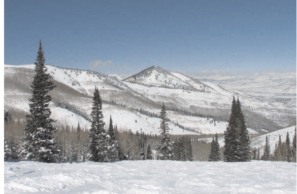
Park City Overview