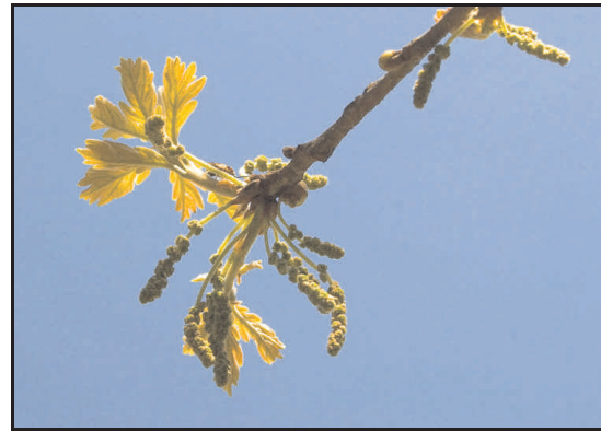
Budding Tree © Dick Kenyon

Like a metal spring that is compressed and then suddenly released, Spring has seemed to flash by in an instant. With the usual litany of yard work, home maintenance, etc., following the winter season, there hasn't been much time in my life to pursue photography. A brief walk around the yard provided a few subjects of spring foliage and buds. Those fabulous subtle colors of spring have morphed into fully leaved trees, and summer is upon us. It's time to seek out images to match the ten assigned subjects for next year's multiscreen contest.