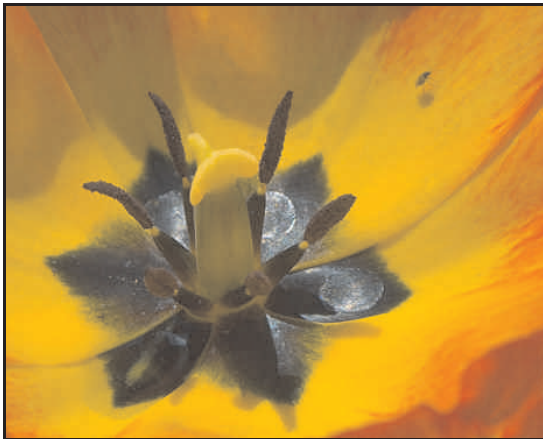
Tulip © Dick Kenyon